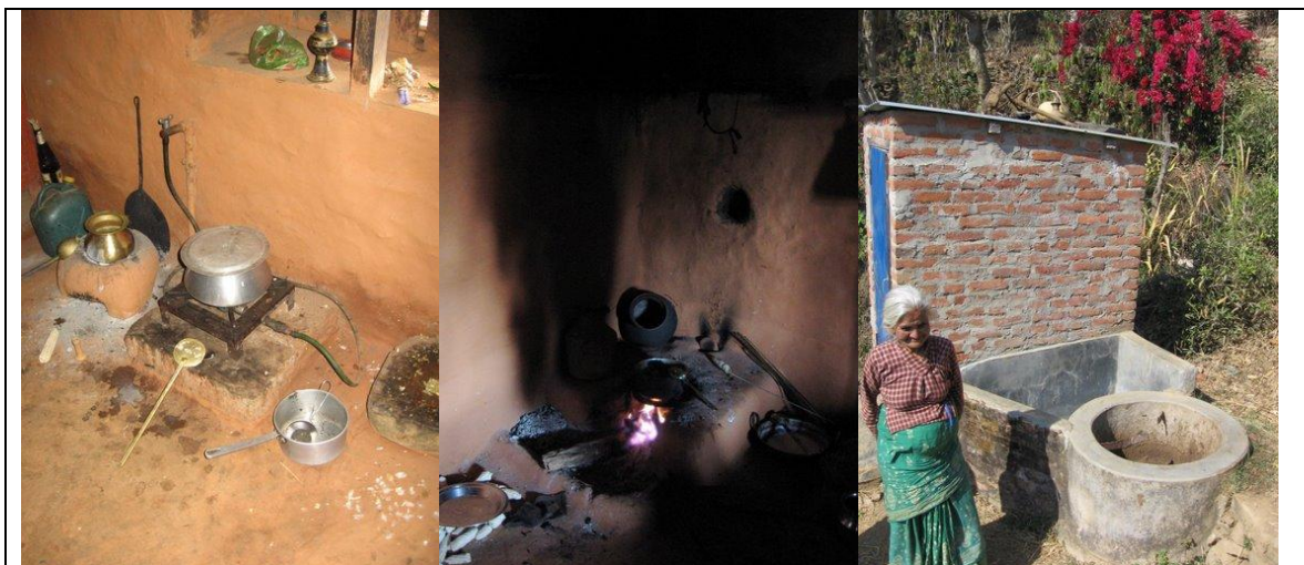
Comparison between an energy efficient biogas stove and traditional firewood stove.