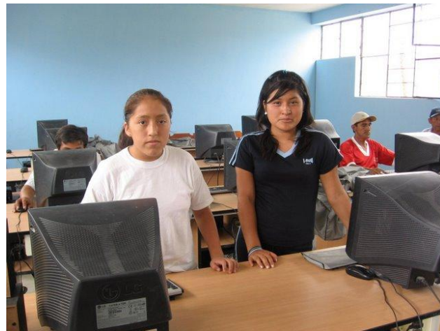
Students at the Computer Lab in La Merced

President of the Parent Teacher Association – La Merced.