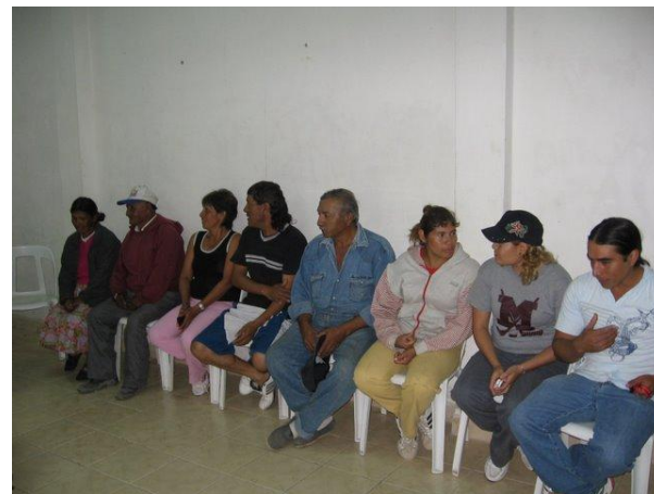
Group discussions with waste pickers in Salta

There are currently 141 full time workers and 300 part time workers in the landfill site and most of the workers are women. They primarily collect plastic, paper and metal. Most of the workers live in the barrios adjacent to the landfill site – and while all the barrios have access to a health center, primary school, electricity, drinking water and transportation, there is a high level of structural poverty, conflict and gender violence in these communities. A key issue is the low price of waste which has fallen significantly due to the global economic downturn.